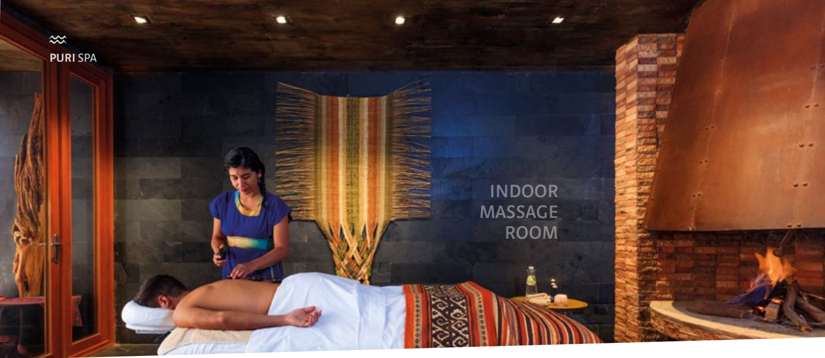
INDOOR MESSAGE ROOM