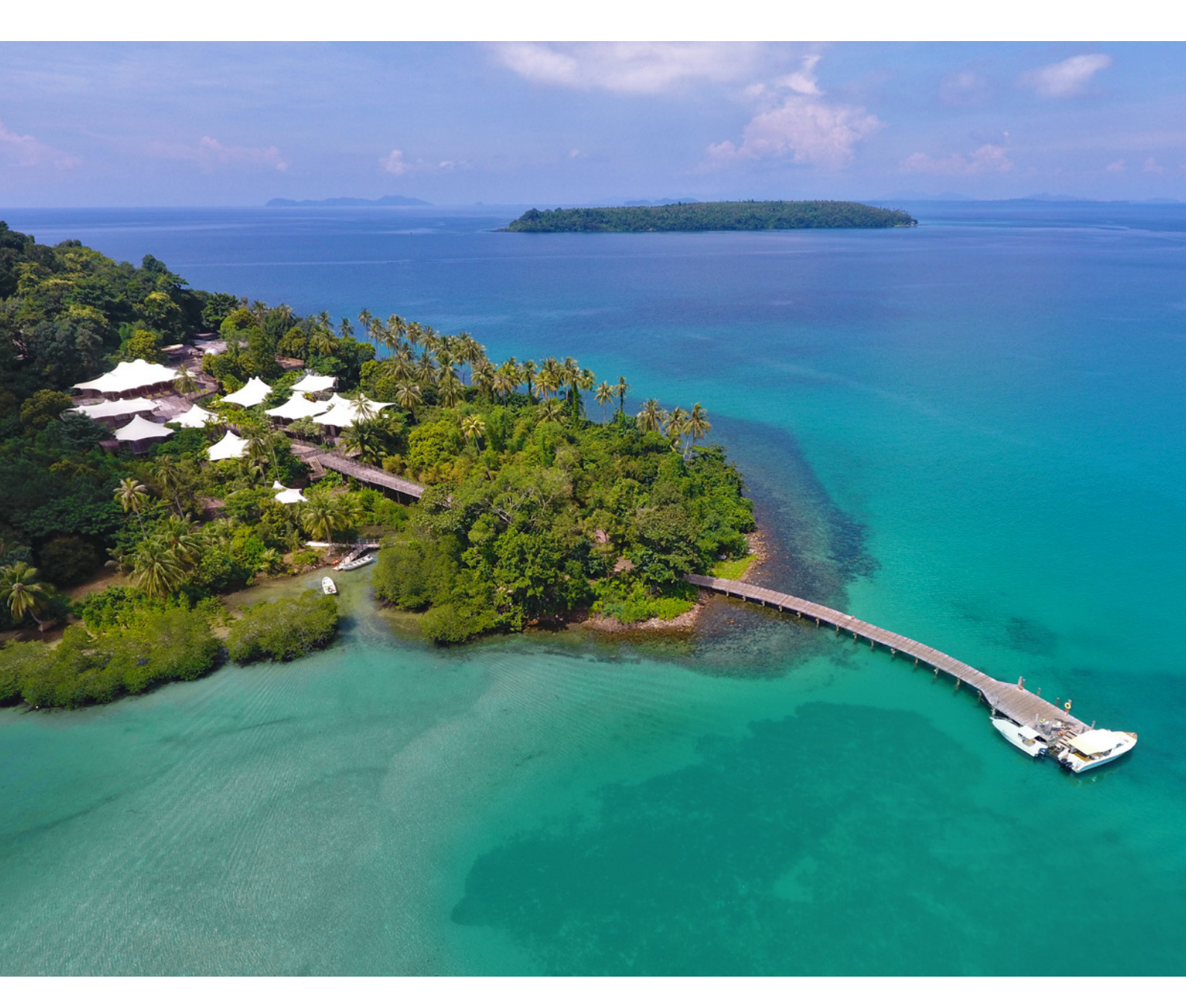
Koh Kood - Thailand