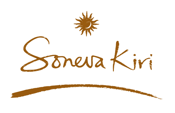
Inspiring a lifetime of rare experiences