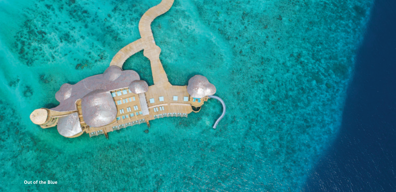
Out of the Blue