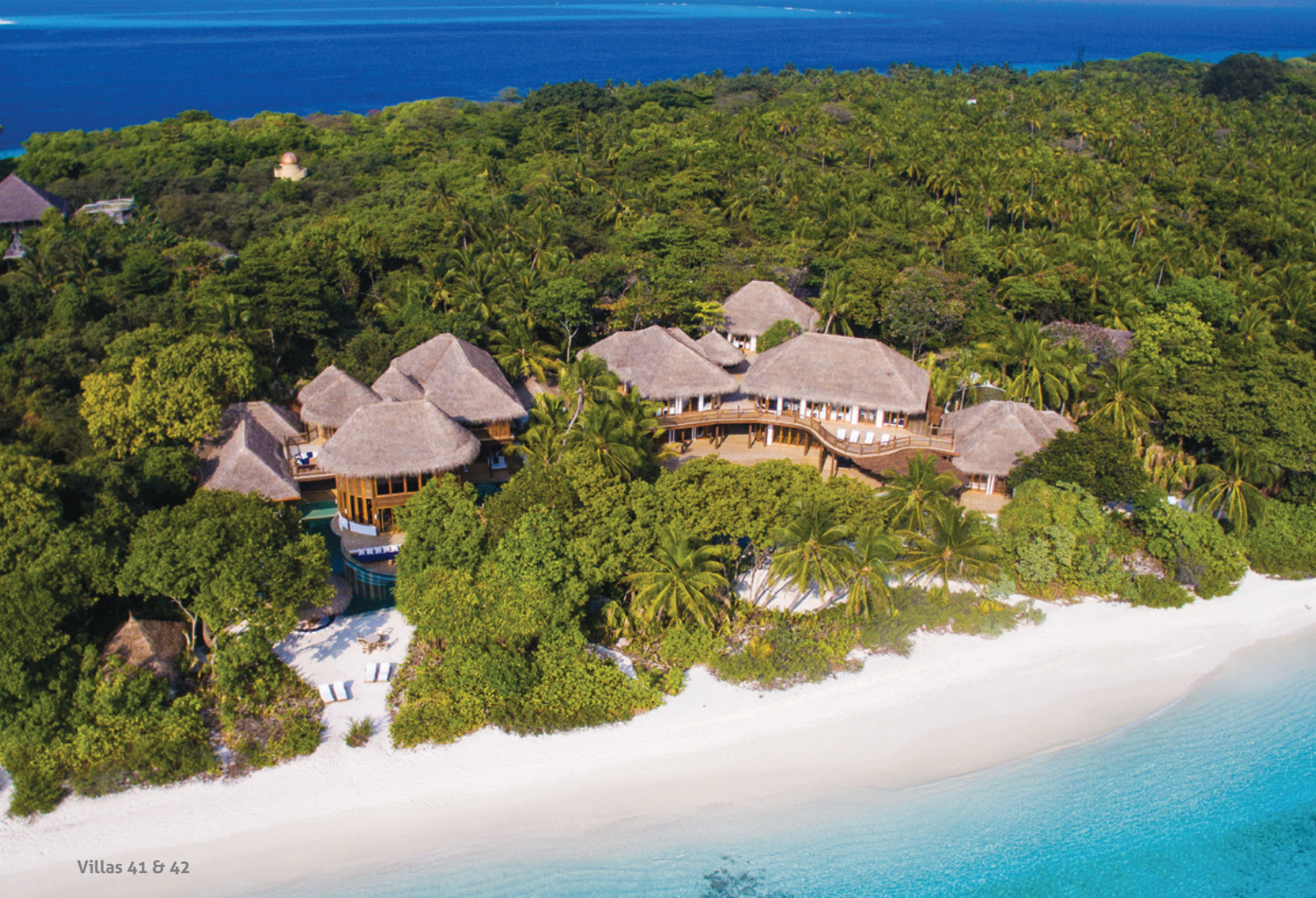
Villas 41 & 42