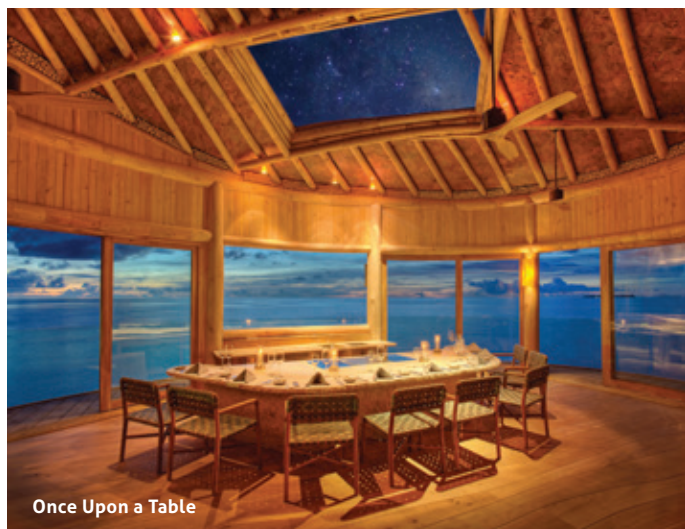
Once Upon a Table

Dinner: Open Mondays, Thursdays and Saturdays